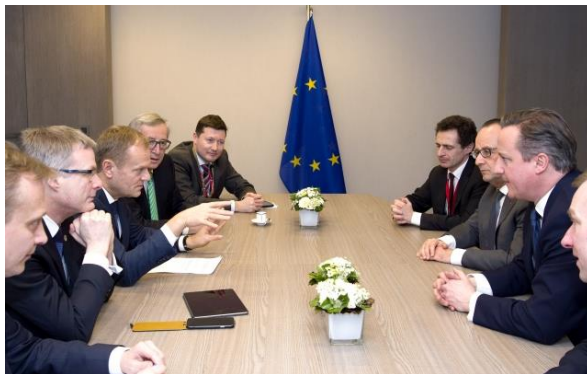
Foto 1 and 2: President Tusk, Commission President Juncker and PM Cameron at the negotiation table

Current European Council President Donald Tusk had indeed an extensive role during the negotiations with the member states regarding the new settlement of the UK. Bilateral meetings of President Tusk took place in order to build consensus among Member States.